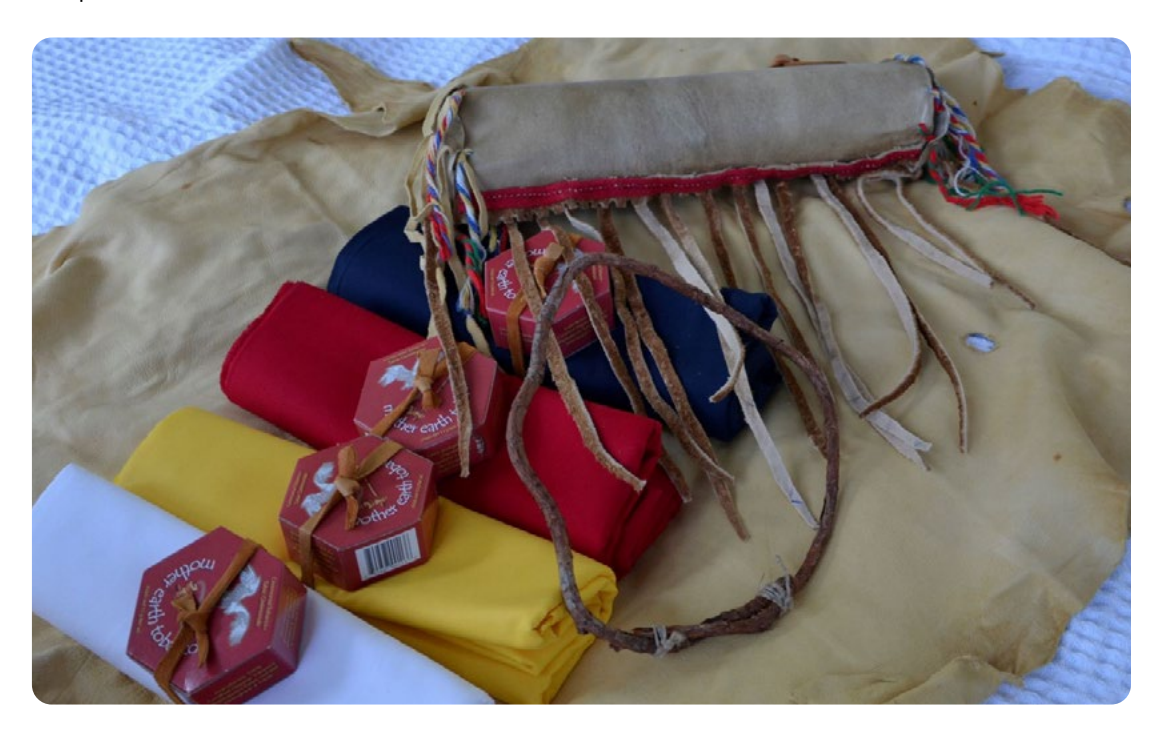
Figure 3. IWAP Bundle with print and tobacco offerings from the May 31 2017 Fort McMurray IWAP Meeting.

Mother Earth and the four directions. Metis participants may prefer to gift items that honour their cultural traditions. Every traditional territory and Pipe Holder holds unique protocols regarding involvement of male and female participants in a Pipe Ceremony. Having a discussion prior to ceremony with the Pipe Holder and supporting Elders involved in ceremony is good practice to ensure participants are all of one mind and can respectfully sit in the circle together during a Pipe Ceremony. The IWAP members will advise on the appropriate ceremony and protocol.