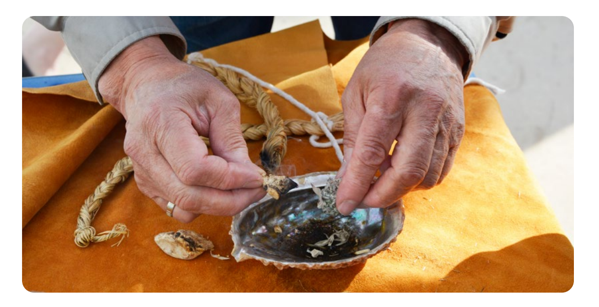
Figure 1. Smudge offering during the May 31, 2017 Fort McMurray IWAP Meeting.

a meeting to order might be considered similar to a smudge<sup>20</sup>. The smudging ceremony and opening prayer for each IWAP gathering, led by a Traditional Host<sup>21</sup>, grants the OCS the authority to hold the Panel meeting and to call the meeting to order.